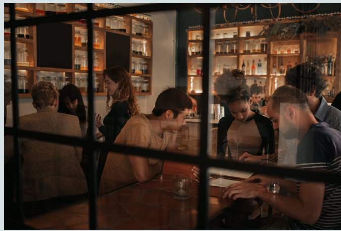
Club or drink establishment