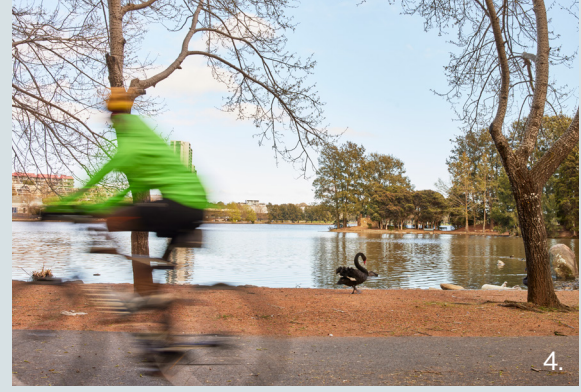
Set within a wellestablished town centre location.